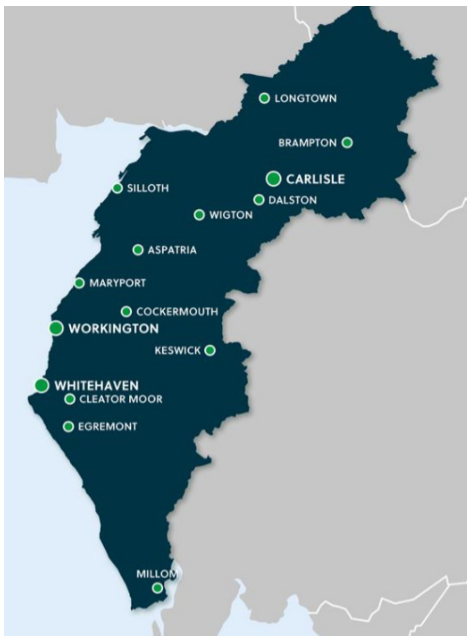
Fig. 2 Map of Cumberland

Cumberland covers a large geographical area with many people living in rural areas. 53% of Cumberland's population live in areas classed as rural, the county is sparsely populated with 91 people per km 2 . Approximately 72,313 children and young people aged 0-25 live in Cumberland, this equates to 26.4% of Cumberland's population. 14 of Cumberland's areas as classified as being within the 10% most deprived areas in England, and many rural communities have limited public transport links, poor access to services and experience social isolation.