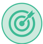
Fig 1. Cumberland Council Values

Cumberland Council have committed to a set of values that underpins not just what we do, but how we strive to do these things.